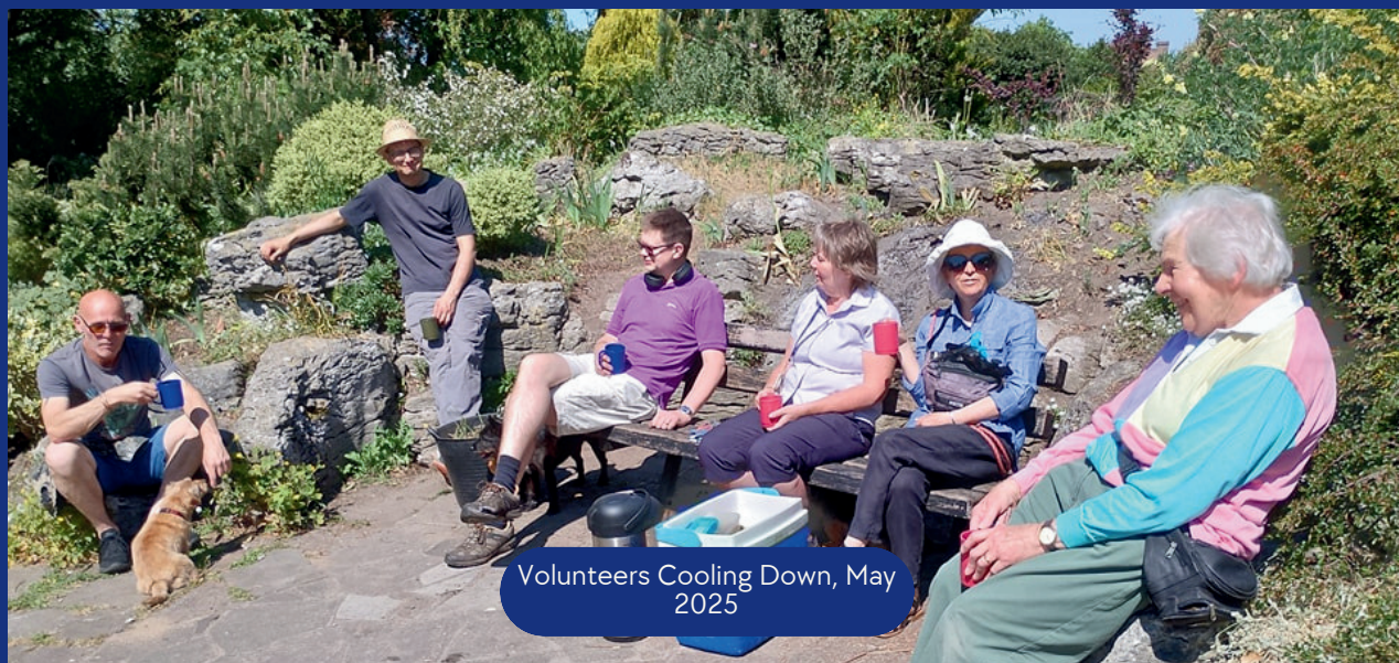
Volunteers Cooling Down, May 2025