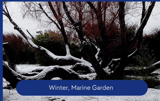
Winter, Marine Garden