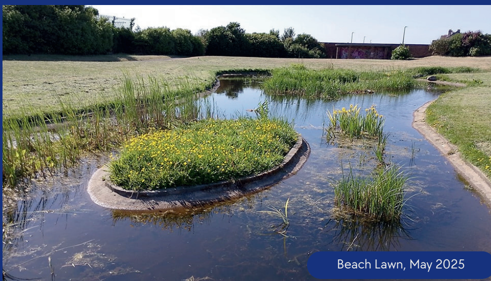
Beach Lawn, May 2025

We have also worked on the ravine and rockery area to uncover stone ornamental areas along the path.